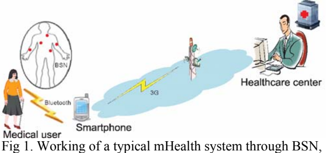
g 1. Working of a typical mHealth system through BSN, Source: Internet

In today's rapidly growing society, mHealth has been envisioned as the most important computer application to provide healthcare services. mHealth is basically a concept which uses wearable and implantable "BODY SENSOR NODES" (BSN) to detect and cure any disease. Using these nodes, the patients are not restricted to get a treatment from some clinic or hospital. Once they are connected to the service providers through a mobile app, Internet connection and the body sensor nodes; the users can avail the services with ease as per their wish, from anywhere anytime.