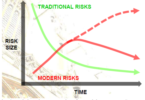
Fig 2. Risk-Time graph of Health Issues

On the facts based on the demographics of population growth and the ever-increasing health constraints, medical practitioners felt the need to connect to patients in a more technical and efficient way. The high burden of disease prevalence and less availability of doctors and other facilities was a major concern which led to the development of the concept and need of mHealth technologies. Other factors which motivated for spread of mHealth include large number of rural inhabitants who are unable to avail assured medical guidance and the rise in mobile phone usage in all sectors of the nation.